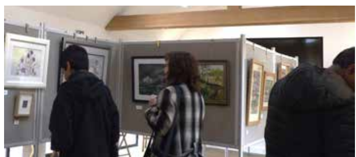
The crowds flock in!

Awards will be presented by the Mayor of Rugby at our meeting on Wednesday, 6 December. Drinks will be provided but please bring some tasty nibbles with you for members to share. There'll also be a surprise guest whose work is guaranteed to make you smile!