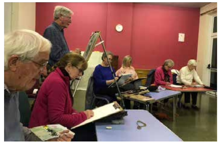
Deep in concentration at one of the Society sketching evenings held at Bilton Methodist church during November.