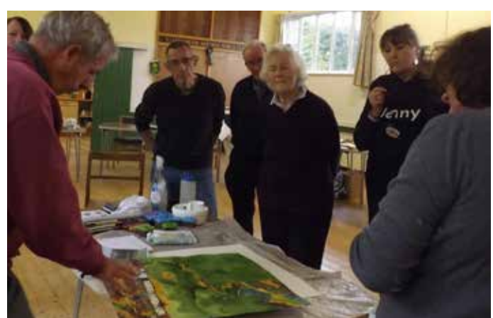
Making it look easy!