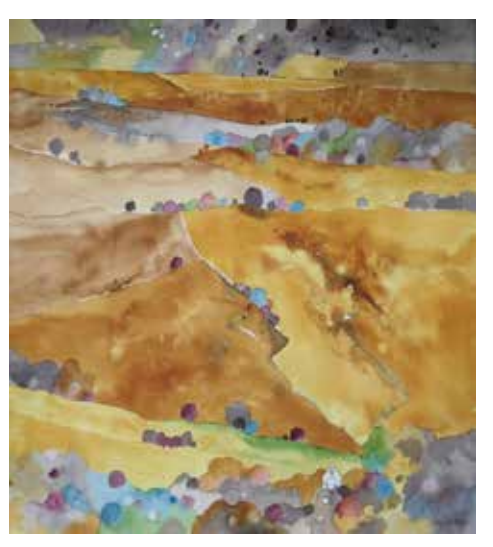
Roger's finished demonstration painting (now in the Rugby Open Exhibition)