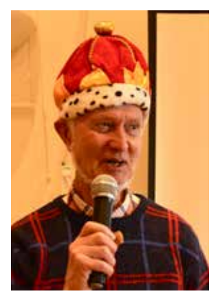
Our president celebrates the platinum jubilee at the June meeting. (That's the Queen's jubilee – not his!)