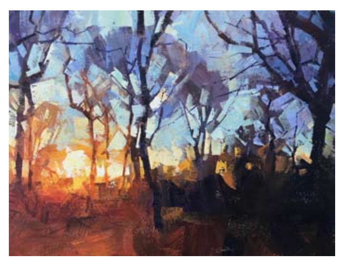
Some of Hashim Akib's remarkable work