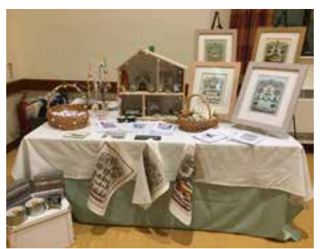
Bethany's stall at the meeting

Be inspired by Bethany's website, bluecoppice.com, where you can buy a variety of products, designs and beginner kits to start yourself stitching.