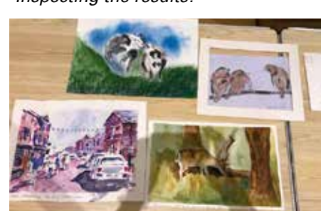
Some of the results!