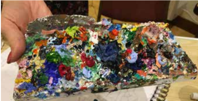
Jessica's acrylic palette is a work of art in itself!