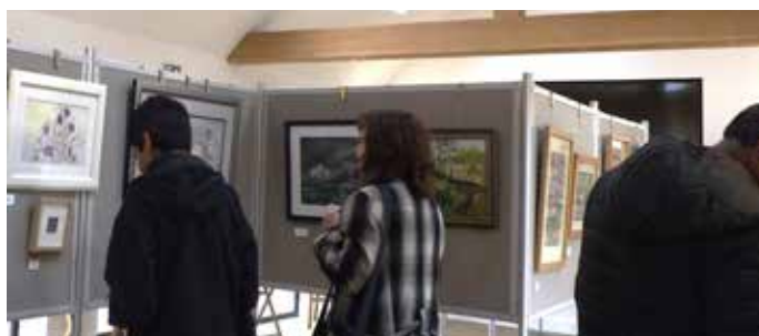
The crowds flock in!

Awards will be presented by the Mayor of Rugby at our meeting on Wednesday, 6 December. Drinks will be provided but please bring some tasty nibbles with you for members to share. There'll also be a surprise guest whose work is guaranteed to make you smile!