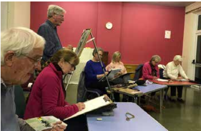
Deep in concentration at one of the Society sketching evenings held at Bilton Methodist church during November.