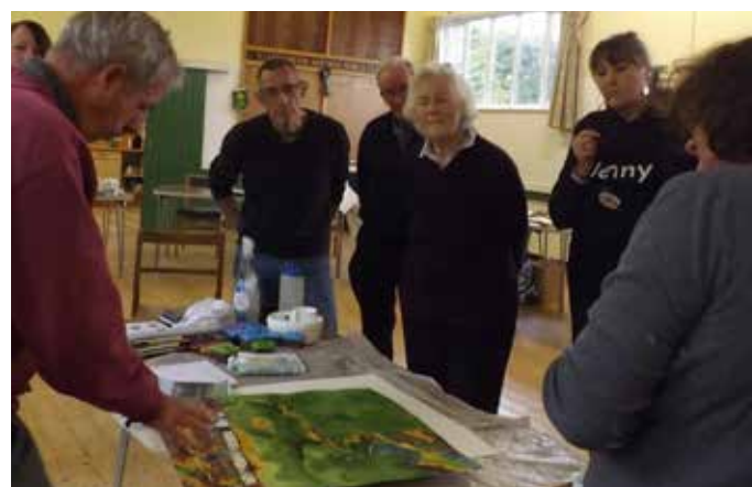
Making it look easy!