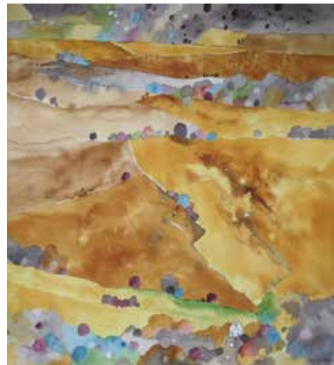
Roger's finished demonstration painting (now in the Rugby Open Exhibition)