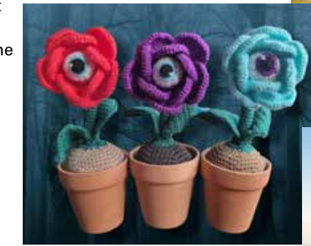
The irripressible Fifoldaramakes!

Few of us will probably ever attempt the complexity of Eric's techniques but it was a fascinating evening to see how a master does it.