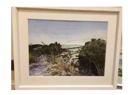
Some of Jane Archer's beautiful work