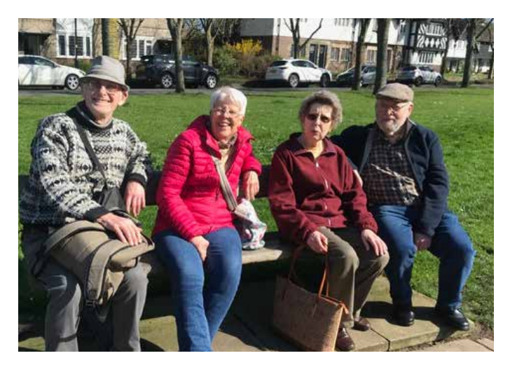
Happy holidaymakers in the Liverpool sunshine

Next day, we were taken to Southport to spend a couples of hours exploring the galleries, shops and seaside. Then on to Crosby beach to see Anthony Gormley's sculptures of 100 cast iron figures facing the sea. The following day was spent visiting galleries in the city; The Walker Gallery, The Tate and The Maritime Museum.